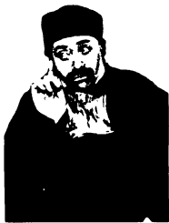
As an old French judge